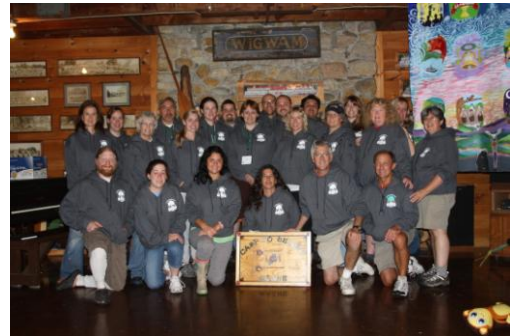
2011 CTB Maine Counselors

The number of individuals who give their time, resources, money are too numerous to name, but please know how much your contributions are valued. CTB Maine is a grassroots effort and our success depends on all generosities; there is no such thing as a small contribution.